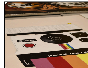
Bright and eye-catching colors!