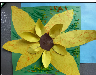
1 st Grade: Elijah's Texture Sunflower