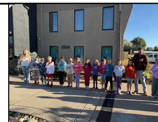
Sometimes music rings outside the school too!