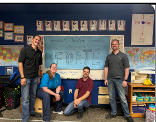
Welcome Forté Handbell Quartet!