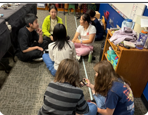
Handbell students ready to learn!