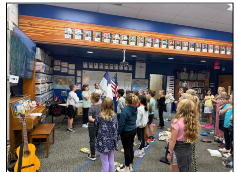
Starting out class with our pledges!

2nd-3rd Grade: Our Beginning Artists discover and use the Elements of Art as tools to be creative. This quarter we learned about types of LINES and