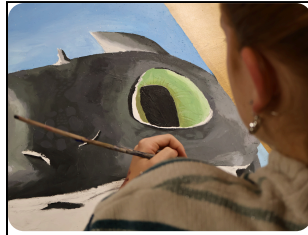
Over-the-shoulder glimpse at some of the secondary's awesome artwork...