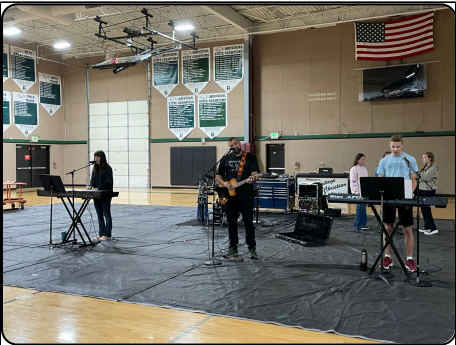
Practicing and preparing to lead worship on Wednesday morning!