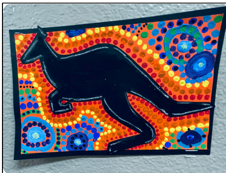
5 th Grade Kasiah's Australian Dot Art...