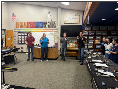
First ever ringing workshop at HCA!