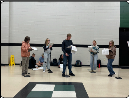
Drama students hard at work juggling scripts and microphones...

This fall, seniors are hard at work creating some beautiful and unique ceiling tiles! High school also completed a Japanese Notan with positive and negative space and are currently working on radial symmetry in color wheels. Junior high completed a similar Notan, followed by an art project containing the elements of art (space, form, color, etc.) The school's hallways, from the downstairs to the stairwells and around the upper floor, are certainly flourishing with fabulous fine art! Thank you, Wendy Nettleton for leading the students in such wonderful projects!