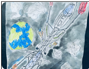
2nd Grade: Beckham's Space Rocket