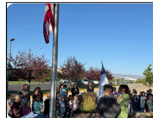
Meet & Sing at the flagpole...