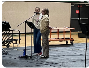
Harmonizing for Chapel