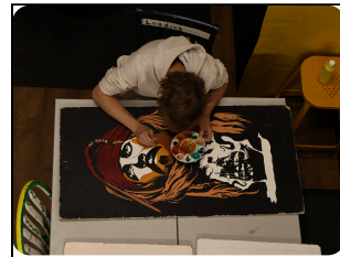
Getting a view of the whole picture from above!